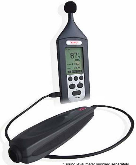
*Sound level meter supplied separately